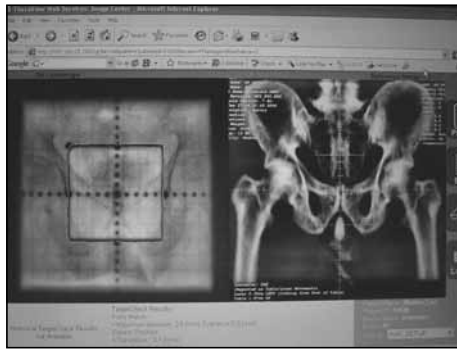
A close-up view of TheraView EPID internet software module showing a comparison between electronically acquired image (left) and CT Digitally Reconstructed Radiograph (right).

One possible option of achieving this was to use one of several available Internet teleconferencing tools, such as Gotomeeting or Webex. But these tools are not free. They require registration and subscriptions with monthly payments. They require a dialogue between the local and remote computers. The user at the remote location would then take control over the local EPID computer and navigate it as if she he or she were actually on site. To allow this to happen, users would first initiate the process from a local computer that has access to the Internet and is connected to the TheraView EPID through the intranet. The local user would then alert the remote user (e.g. physician) of the established connection either by pager, telephone, email, text messaging or any other communication device. Note that the local computer will access the images through the intranet con-