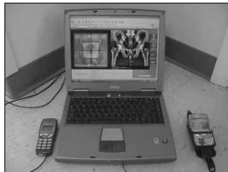
Remote laptop PC with no wireless card at a remote location showing the comparison of TheraView EPID portal images through its Internet software module.

nection, while the remote computer would access this local computer's intranet through the Internet network. In this option, the local and remote computers do not need to have static IP address configurations.